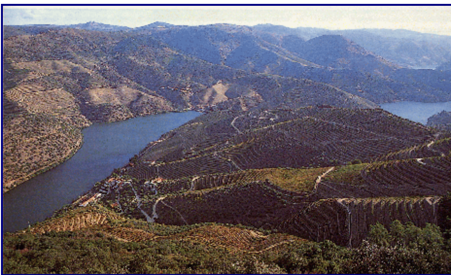
The valley of the Upper Douro, lined with terraced vineyards

On a happier note, there was a tasting at the Club not too long ago featuring a superb lunch and a number of fortified and/or sweet wines. There was port of course (including the sensational '63 Dow's mentioned earlier), but also sherry, Madeira, Sauternes and Banyuls. Rest assured that we didn't drink the Club's port stocks dry: there are, for example, some choice '97s waiting for you to enjoy, in addition to those 2000s – but all in good time. For immediate drinking, we have Dow's 1970, 1977 and 1980, as well as some non-vintage offerings. All are subject to the Club's attractive pricing policy. A final piece of good news is that the UCT Wine Circle plans to make the pre-Yuletide port lunch an annual fixture. See you in December! □