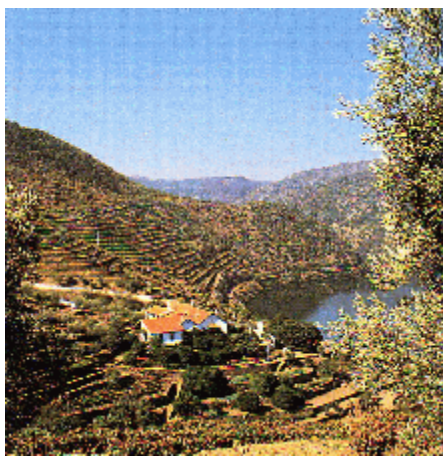
Taylor's flagship estate, Vargellas, one of the remote and beautiful quintas, or wine estates, of the Upper Douro

The wine itself must traditionally be made in and shipped from Vila Nova de Gaia, but the grapes are grown on quintas (estates) far up the Douro. How anything grows on the terraced banks of the upper reaches of the river is a miracle: there is more schist than soil and the slopes are vertiginous. Terrifying driving (again), but spectacular views. The summer heat is intense and