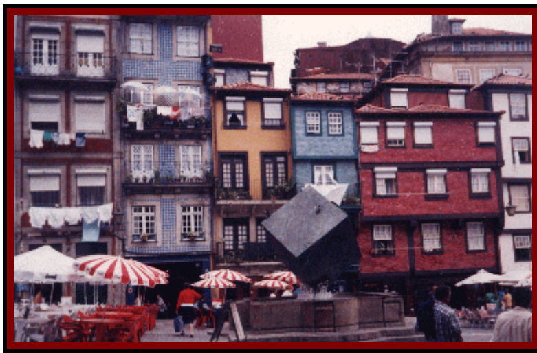
The town of Oporto

Families of English origin still dominate the port trade. One inescapable name is that of Symington, a concern with a vast empire that now includes many of the historic houses (Graham's, Warre's, Dow's, Smith Woodhouse, Gould Campbell, Quarles Harris). Taylor's is also famous, always of high quality, with a hint of violets on the nose. The shipper matters: even the individual